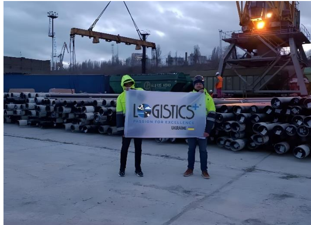
Logistics Plus managed the complex delivery of $100 million worth of gas pipes to Ukraine in late 2023.