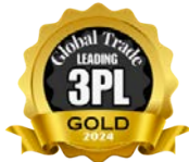
2024 GLOBAL TRADE MAGAZINE TOP 150 3PL (5TH TIME)