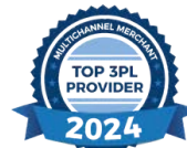
2024 MULTICHANNEL MERCHANT TOP 3PL (7TH YEAR)